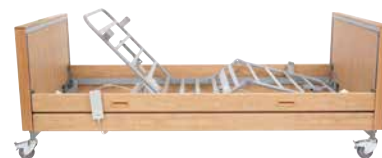
Medley Ergo Oak

The flexible design of the Medley Ergo Low allows the bed to be mounted at a low height, or a higher position if preferred, creating a range of working heights for the carer and transfer heights for the client. This is facilitated by the unique feature of the bed end, which enables the mattress support to be mounted in both upper and lower positions.